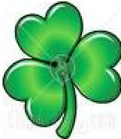
Top O' the Morning