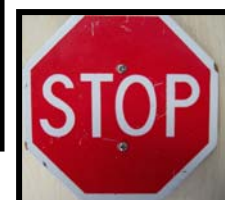
Red Day makes a connection with literacy.