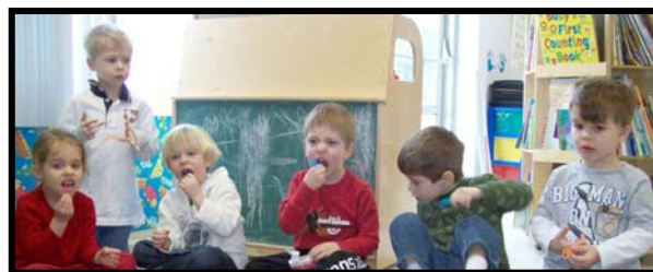
Brushing and flossing