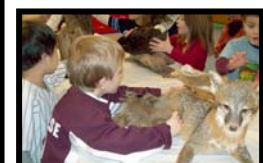
Finch Hollow Fox exhibit