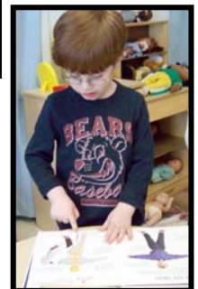
Reading a book about our body