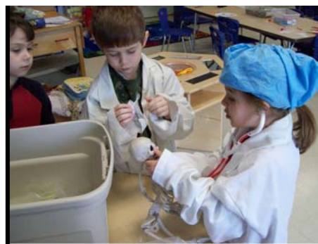
UPK Doctors examine bones