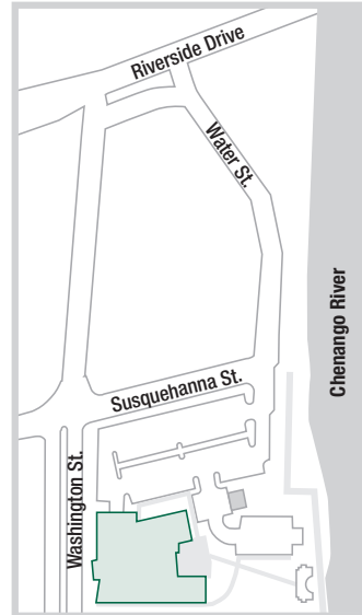
University Downtown Center 67 Washington St., Binghamton