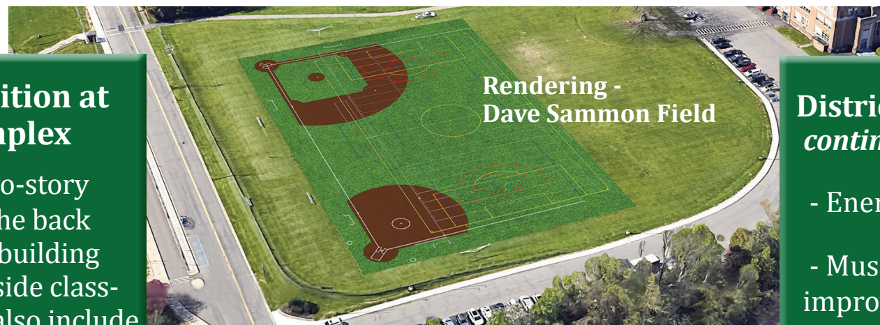
Rendering - Dave Sammon Field

In the case of an emergency situation in any of our schools, these upgrades could make a vital impact to the outcome.